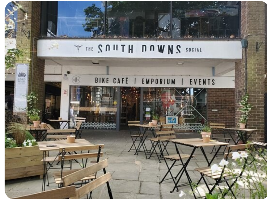
The South Downs Social, Winchester