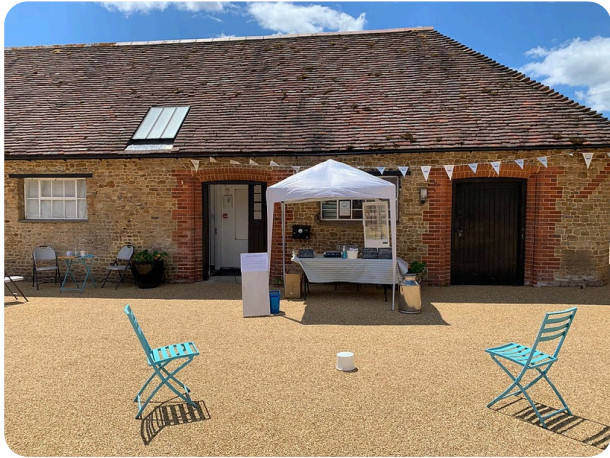
Pierrepont Farm, Surrey