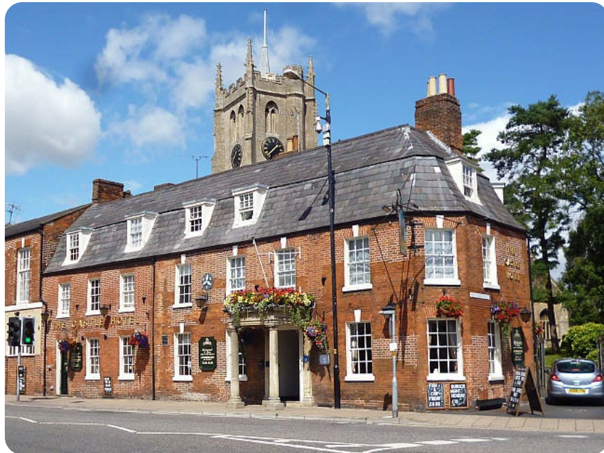
Castle Hotel, Devizes